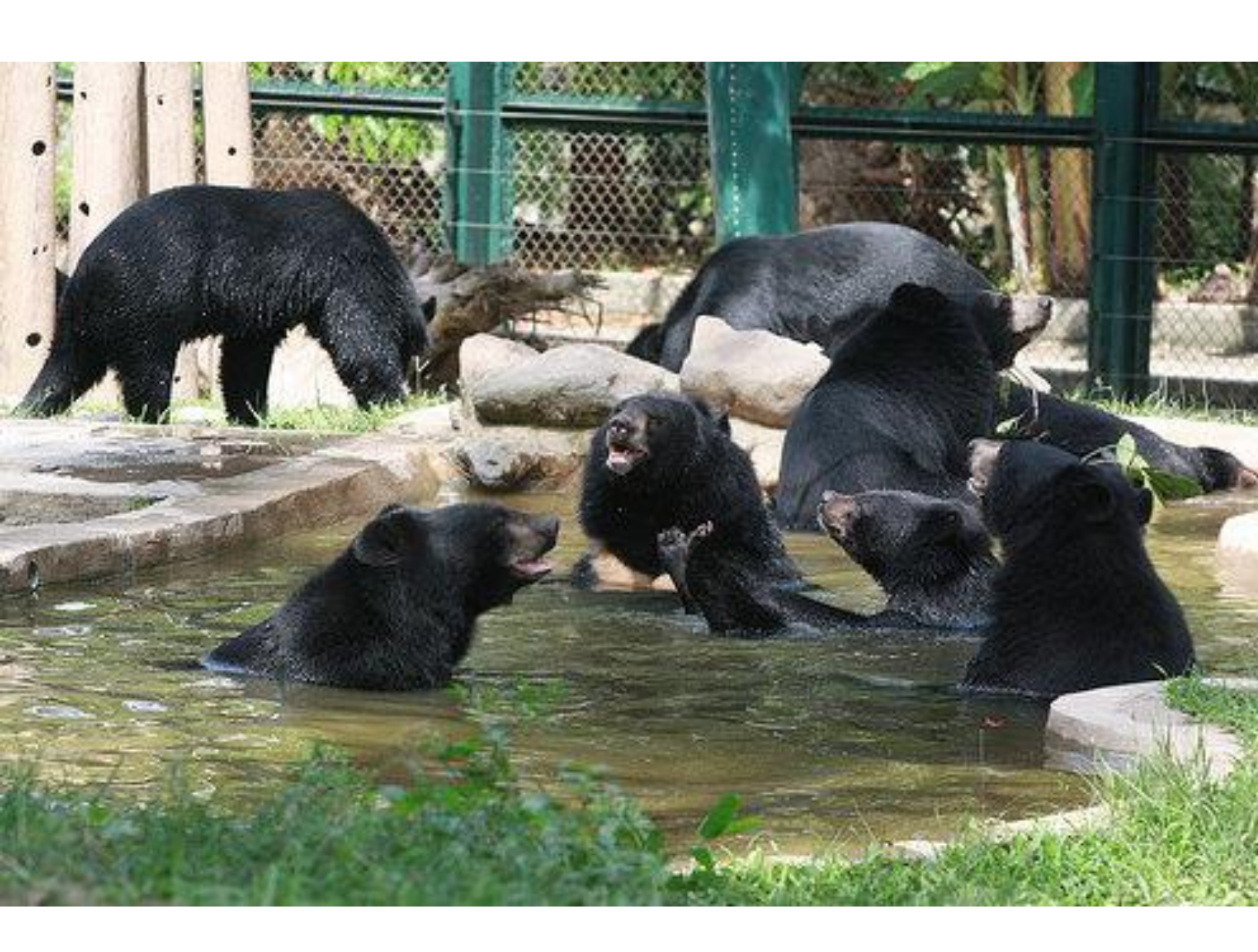
Join the family ... be part of the end game