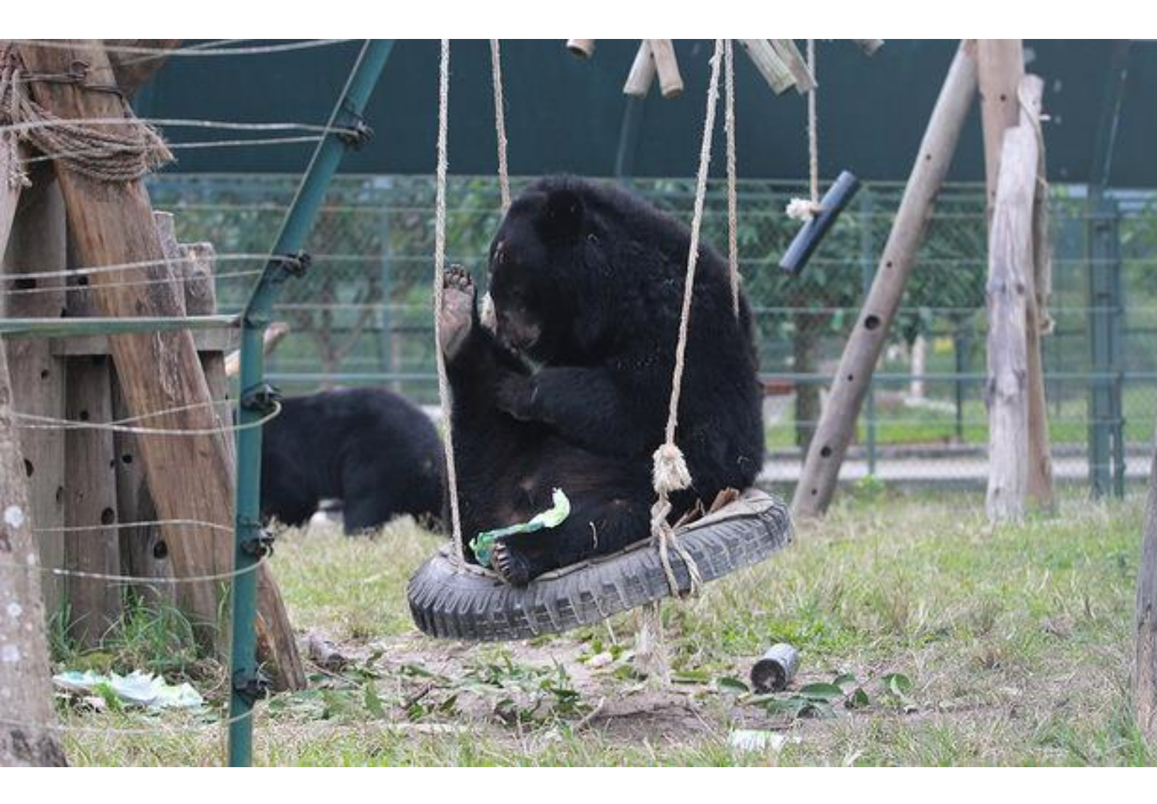
Page | 2